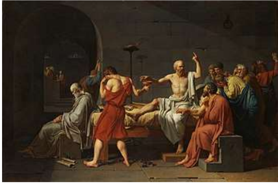
Socrates hand pointing upwards