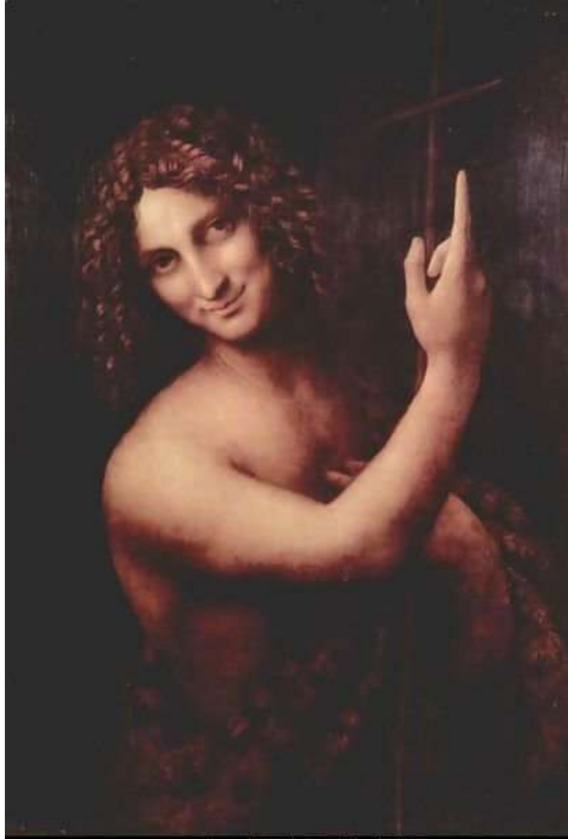
SAINT JOHN HANDS IN SIMILAR FASHION POINTING UPWARDS